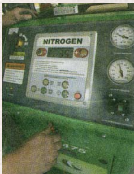
A nitrogen machine is used to add nitrogen to the tires of a police cruiser at the Marion County Sheriff's Office in Ocala on Thursday.

That's because the nitrogen system maintains tire pressure, unlike tires filled with compressed air that have